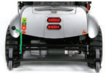
Kerbmaster Anti-grounding & Anti-tipping Smoother and safer journeys with style