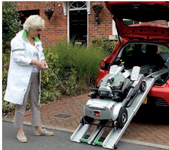
Quingo Flyte Docking Station Easily load and unload the Quingo Flyte in less than 60 secs.