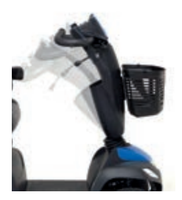
Finite tiller movement

Users can easily adjust the tiller with a lever to suit their needs.