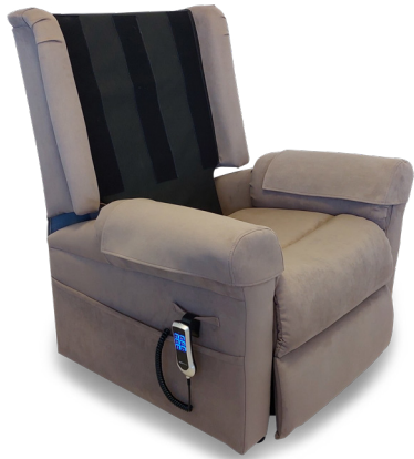
REMOVABLE BACKREST CUSHIONS