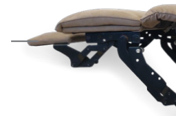
← 500mm TO FRONT →