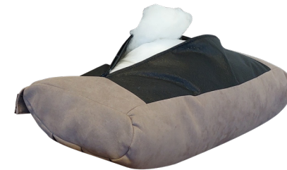
CUSTOMISABLE INTERIOR PILLOW FILLING