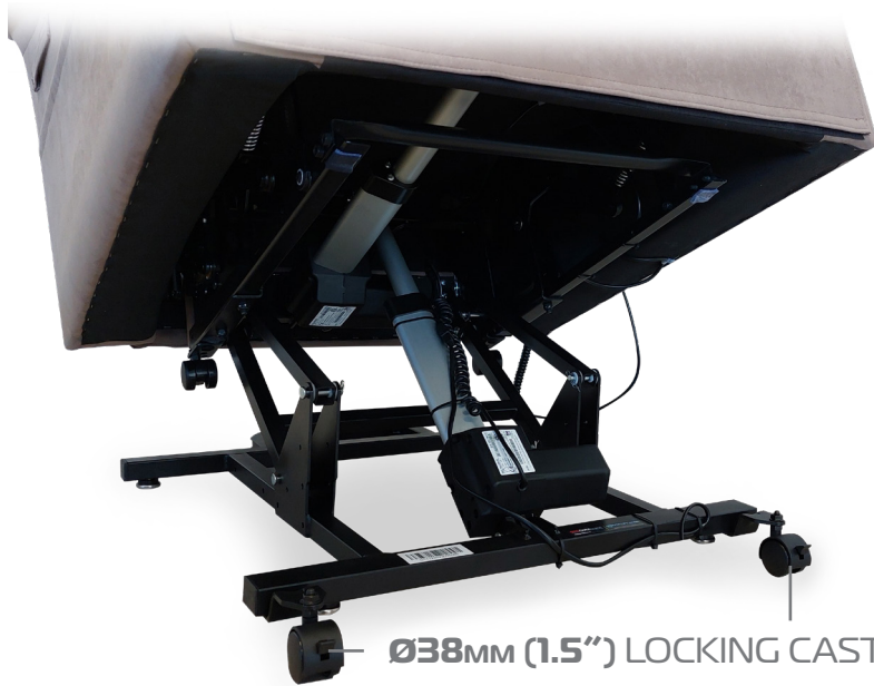
Ø38mm (1.5") LOCKING CASTORS