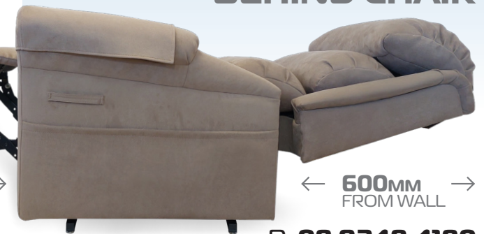
← 600mm FROM WALL →