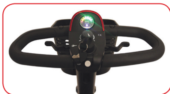
Easy Drive Tiller

The Go-Go ® Sport delivers high-performance and convenience on the go. With a 147 kg (325 lb.) weight capacity, a charger port in the tiller, standard front LED lighting and a maximum speed up to 7.56 km/h (4.7 mph), the Go-Go ® Sport is feature rich and travel ready.